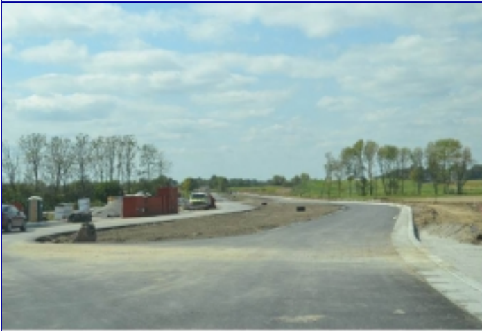
A portion of the new 186 th Street extension on the south end of the Sports Campus