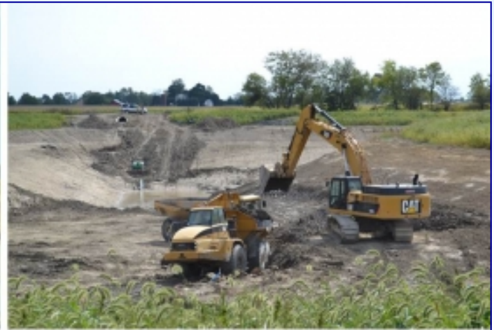
Crews shaping a pond in the soccer section of the Sports Campus