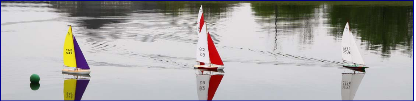
No, sail number 82 does not have an illegal sail extension on his main. That's sail number 93 off his port quarter.

Y our editor did manage to drop by the Hourglass Pond in the Village of West Clay for part of the V-32 portion of the May Tug Wilson racing series. Not exactly a blustery day, the V-32 yachts did manage well with tactics and reading the available puffs of breeze playing the major role in determining winners. That plus the chore of keeping the boats out of the emerging weed crop which appears to be expanding rapidly this spring on the pond.