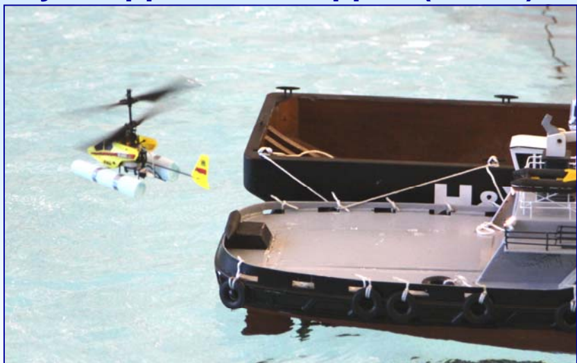
What did happen the last time (below): (Multiple exposures)