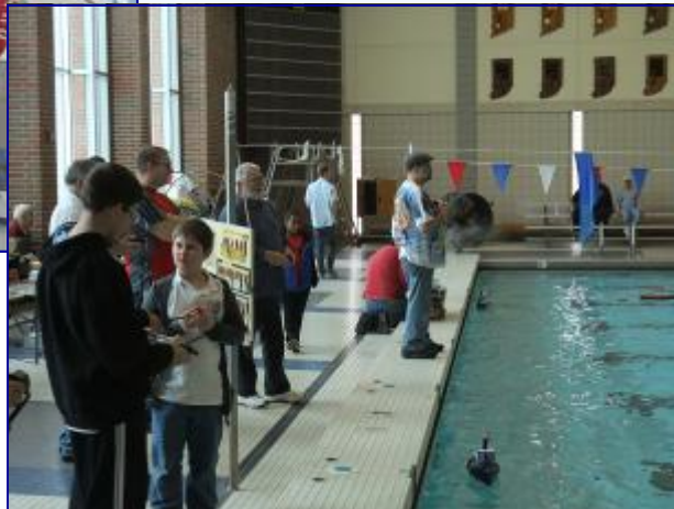
One boat found a unique berth at the pool's edge (next page, center left) An impromptu fast electric course brought out the serious go-fast crowd for a