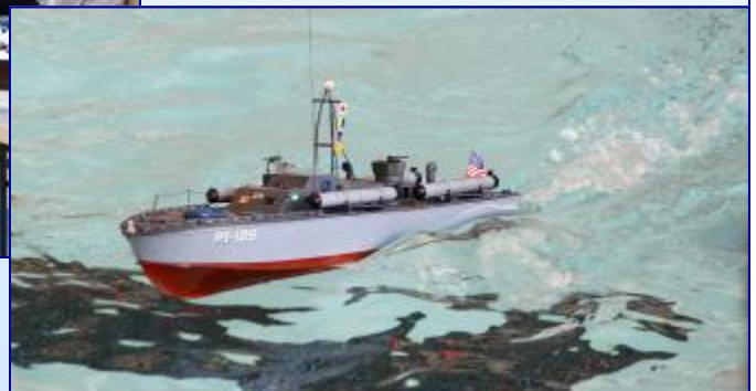
modified oval run. The famed white goose/swan